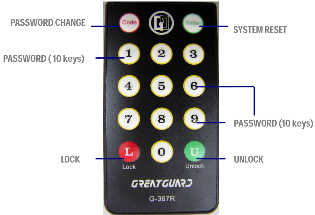
IR remote controller